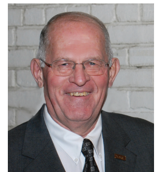
Immediate Past Chair

Professor Emerita and Dean Emerita of Library Services Iowa State University