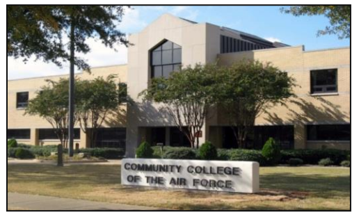
Ryan Hall, CCAF Administrative Center Maxwell AFB, Gunter Annex, Alabama

The administrative staff brings together all elements of the system under the matrix authority of Air Force Instruction 36-2648, Community College of the Air Force . The Community College of the Air Force was located at Randolph AFB, Texas, during 1 April 1972-15 January 1977; at Lackland AFB, Texas, during 16 January 1977-31 March 1979; at Maxwell AFB, Alabama, during 1 April 1979 – 4 November 2008; at Maxwell AFB, Gunter Annex, Alabama, since 5 November 2008.