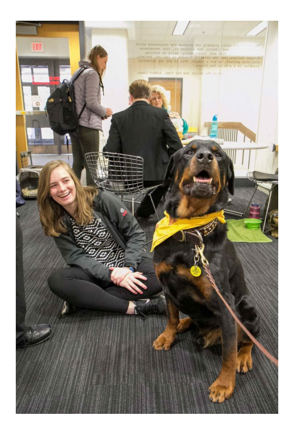
Stephens College is rated as the pet-friendliest women's college in the country