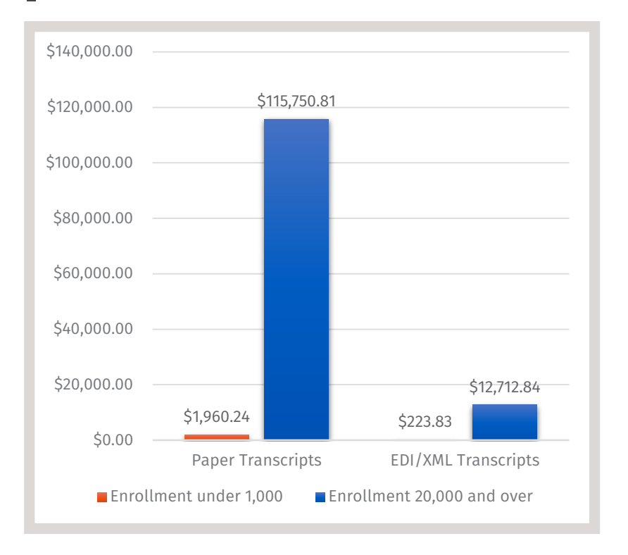
FIGURE 3. Average annual staff costs to process transcripts