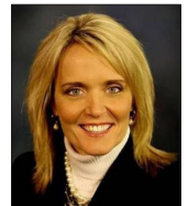
Margie Vandeven Commissioner of Education MO Dept. of Elementary & Secondary Education