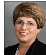
Cindy O'Laughlin Senator; Chairwoman, Education Committee MO General Assembly