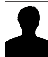
Vacancy Appointing Authority: MO Governor (Higher Education at-large)