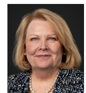
Cindy Winckler State Senator; Ranking Member, Education Appropriations Subcmte, IA Legislature (Alternate)