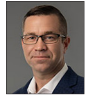
Jesse Green State Senator; Chair, Education Approps Subcmte, IA Legislature