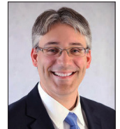
Mike Halpin State Senator; Co-chair, Higher Education Committee, IL General Assembly